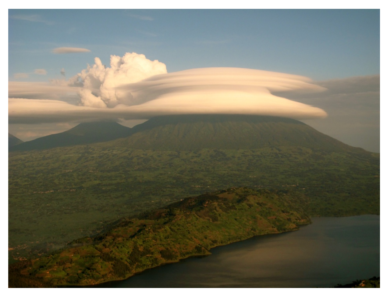
Rwanda, "The Land of a Thousand Hills"

The Rising From Ashes Foundation has been formed in response to the overwhelming support from around the world and our desire to bring the message of hope to as many people as possible. Our goal is to use the Rising From Ashes documentary feature film as the core messaging tool to build out a global movement around the bike for peace, reconciliation, and life transformation.