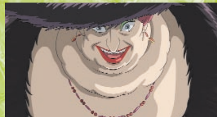
Akihiro Miwa as Witch of the Waste