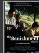
THE BANISHMENT 2007