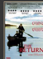
THE RETURN 2003